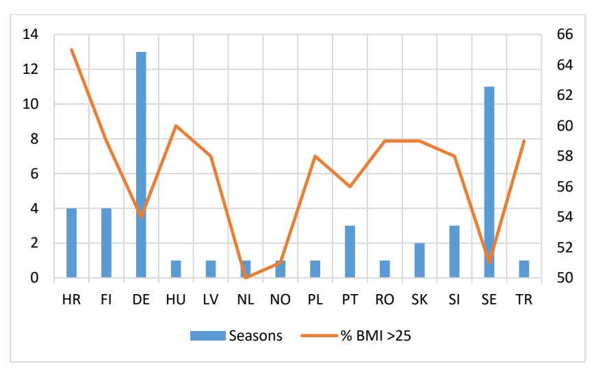
Chart 1: Number of seasons of local versions vs percentage of overweight population

Table 2 shows the relevant data on rates of overweight among the population of a given country. It is notable that all of the countries surveyed record more than 50% of the population as having a BMI greater than 25. The highest figures, were noted in Croatia and Hungary. The highest figures were noted in Croatia (60%) and Hungary (59%), and the lowest rates in The Netherlands (50%) as well as the two Scandinavian countries featured, Norway and Sweden (both at 51%).